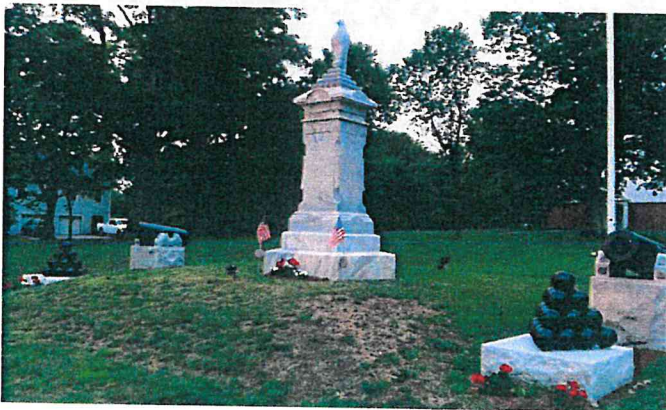
Restored Civil War Monument

Above are a few pictures from this Memorial Day Dedication. The new Vietnam Era monument was unveiled. The Civil War monument went under extensive restoration. The broken eagle (it had no head) was replaced, the cannon pedestals unburied and refurbished, and the cannon balls made and mounted. The WWI and Spanish American War, the WWII, and Korea War monuments were cleaned.